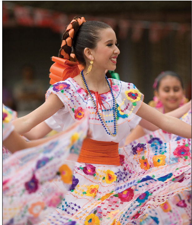
Folkloric dancers, Corpus Christi festival

Please mail application, resume, and transcript to the above e-mail address. Cover letters can be attached, but are not required. Resumes cannot be submitted in lieu of applications. Applications will be reviewed, and top applicants will be contacted for interviews. After a qualified person has been chosen for the specified internship, letters will be mailed to all interviewed applicants letting them know that the position has been filled. Disability access for application submission, testing, and interview accommodations can be provided upon reasonable notice.