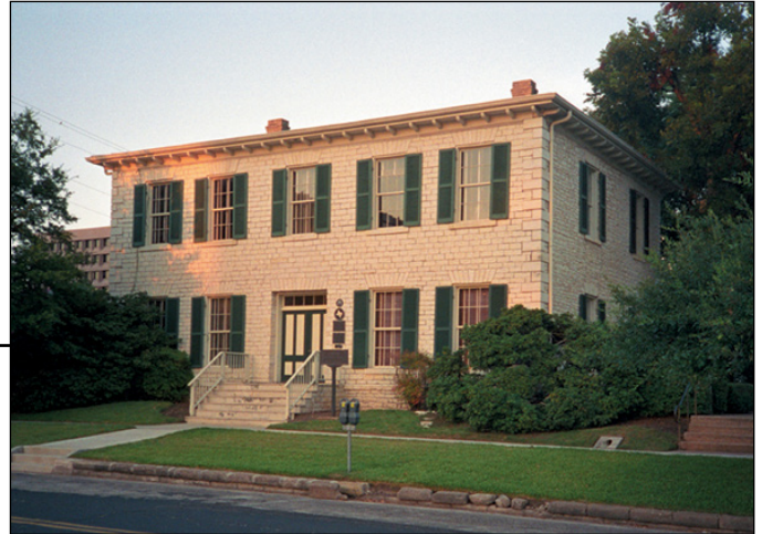
THC's Carrington-Covert House, downtown Austin

The THC is composed of 15 citizen members appointed by the governor to staggered six-year terms. The agency employs nearly 350 people who work in various fields, including archeology, architecture, history, economic development, heritage tourism, public administration, urban planning, and more.