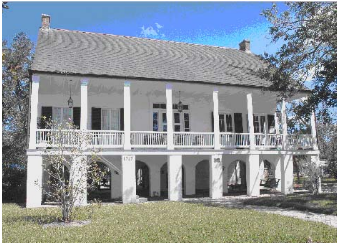
Elevation of a historic residence in Mandeville, Louisiana

While elevating a structure above the BFE will provide the structure the most protection, a less intrusive elevation may be desired or more feasible for a historic structure. Other protection measures, such as elevating utilities and equipment above the BFE, should be considered if elevating a historic structure to the BFE is not practicable.