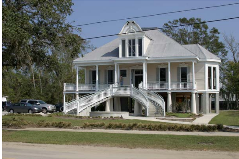
Elevation of a historic residence in Mandeville, Louisiana

Essentially, the steps required for elevating a building are largely the same in all cases. A cradle of steel beams is inserted under the structure; jacks are used to raise both the beams and structure to the desired height; a new elevated foundation for the house is constructed; and the structure is then lowered back onto the new foundation and reconnected. At a minimum, the foundation