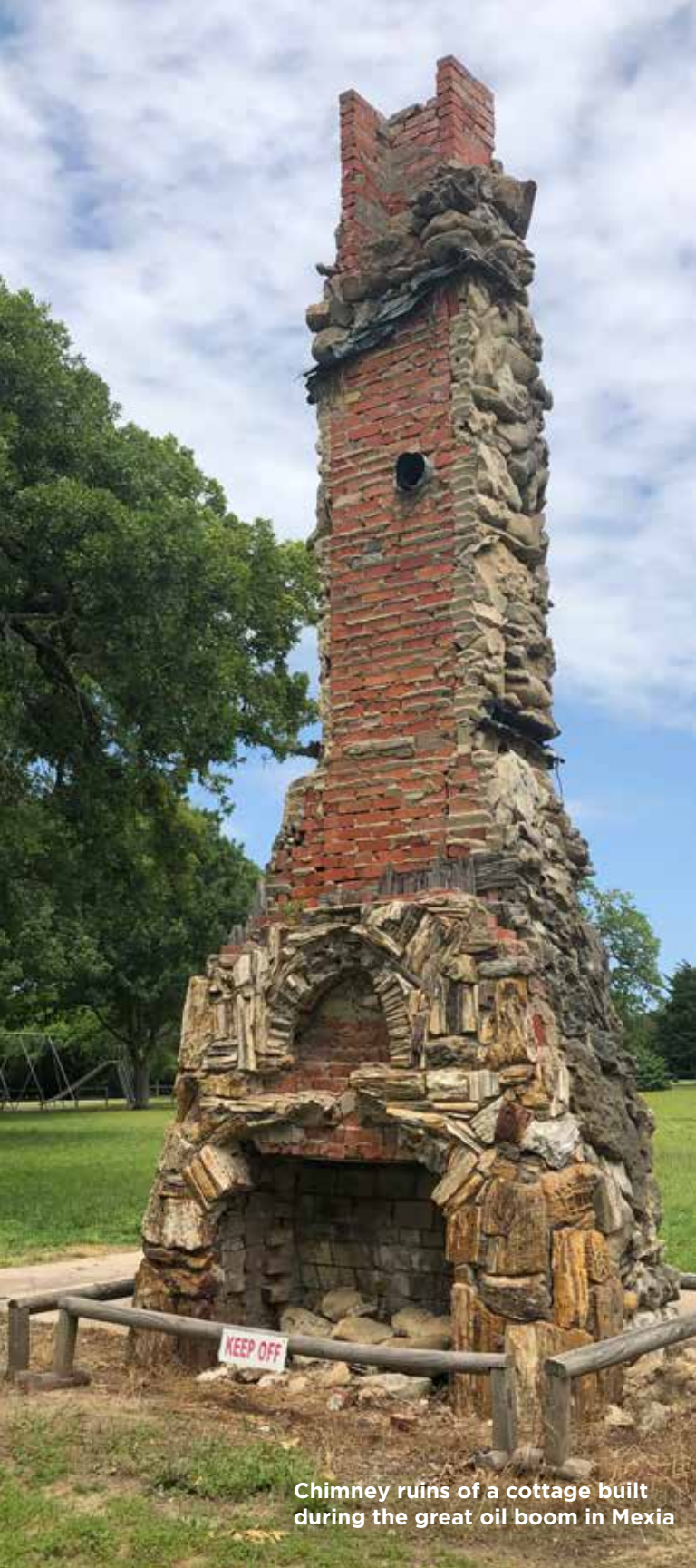
Chimney ruins of a cottage built during the great oil boom in Mexia