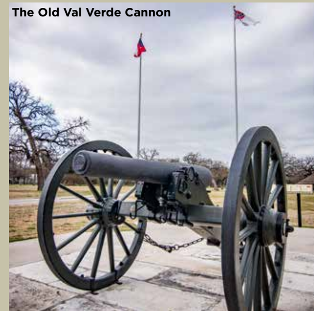
The Old Val Verde Cannon

During the reunions, veterans eulogized those soldiers who, in the words of General Stonewall Jackson, had "cross[ed] over the river and [now] rest under the trees." The gatherings also included parades, brass band concerts, patriotic speakers, games, and traditional Southern foods. Attendees danced the nights away on the wooden floor of the pavilion, now recognized by the National Register of Historic Places for its unusual architecture. By the end of World War I, time had taken a noticeable toll on the aging veterans. The gatherings continued but on a smaller scale.