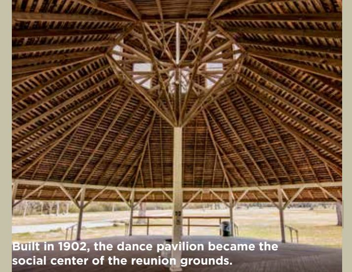
Built in 1902, the dance pavilion became the social center of the reunion grounds.