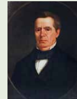
Dr. Anson Jones, 1855.

Dr. Anson Jones arrived in Texas in 1833, settling in Brazoria, where he set up a medical practice and soon became involved in Texas politics. Dr. Jones actively served in the Republic of Texas as a congressman, ambassador, senator, and secretary of state. In 1844, at the height of his political career, Dr. Jones became the president of the Republic and served one year until Texas became the 28th state at the end of 1845.